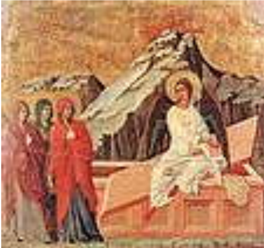
The Three Women at the tomb Duccio di Buoninsegna 1308-11 Tempera on wood Museo dell'Opera del Duomo, Siena