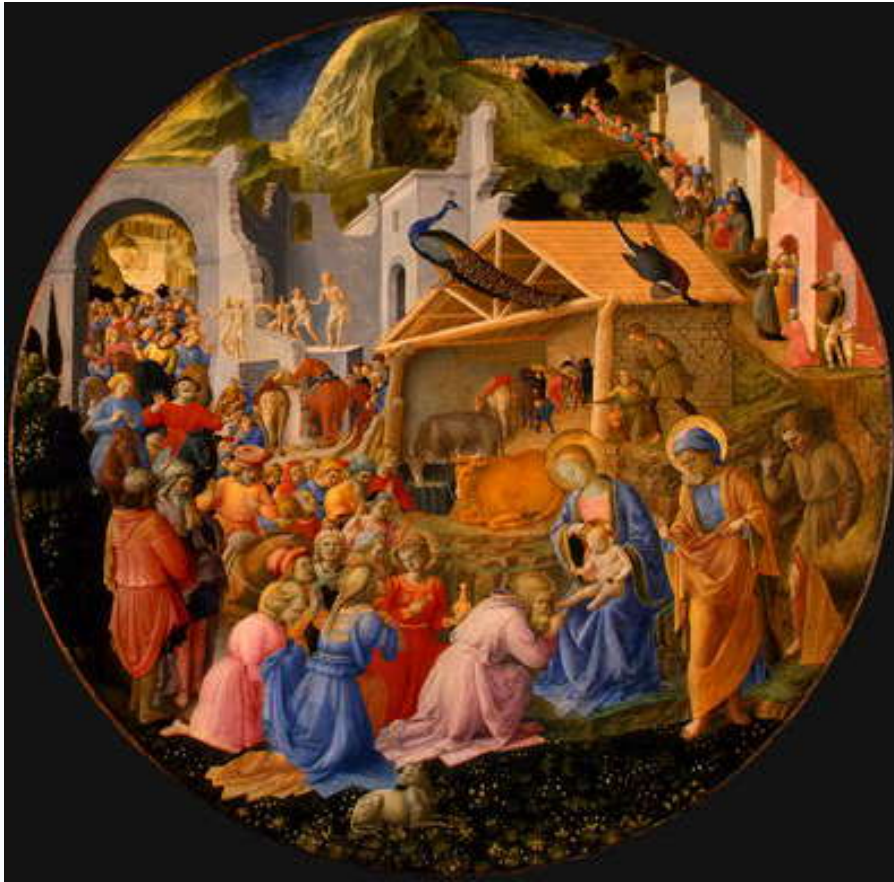
The Adoration of the Magi , Fra Angelico and Fra Filippo Lippi 1440/1460 Samuel H. Kress Collection