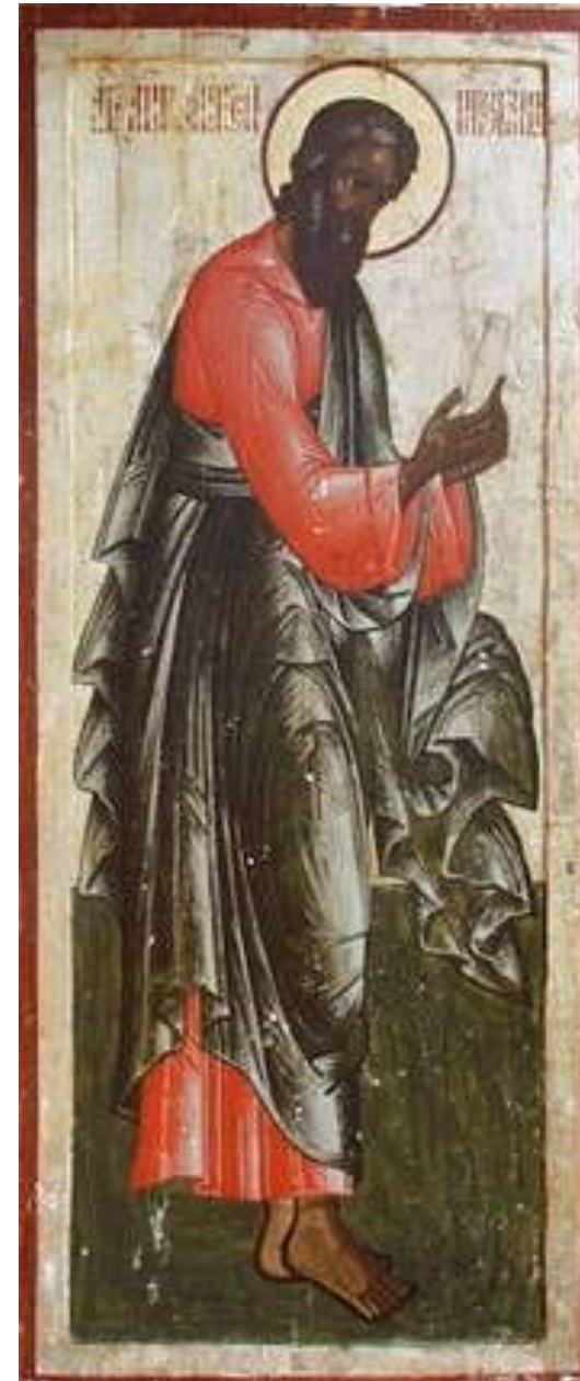
Russian Orthodox icon of the Apostle Andrew, 18th century, Iconostasis of Transfiguration Church, Kizhi monastery, Karelia, Russia